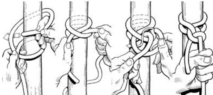
Clove hitch with half hitch