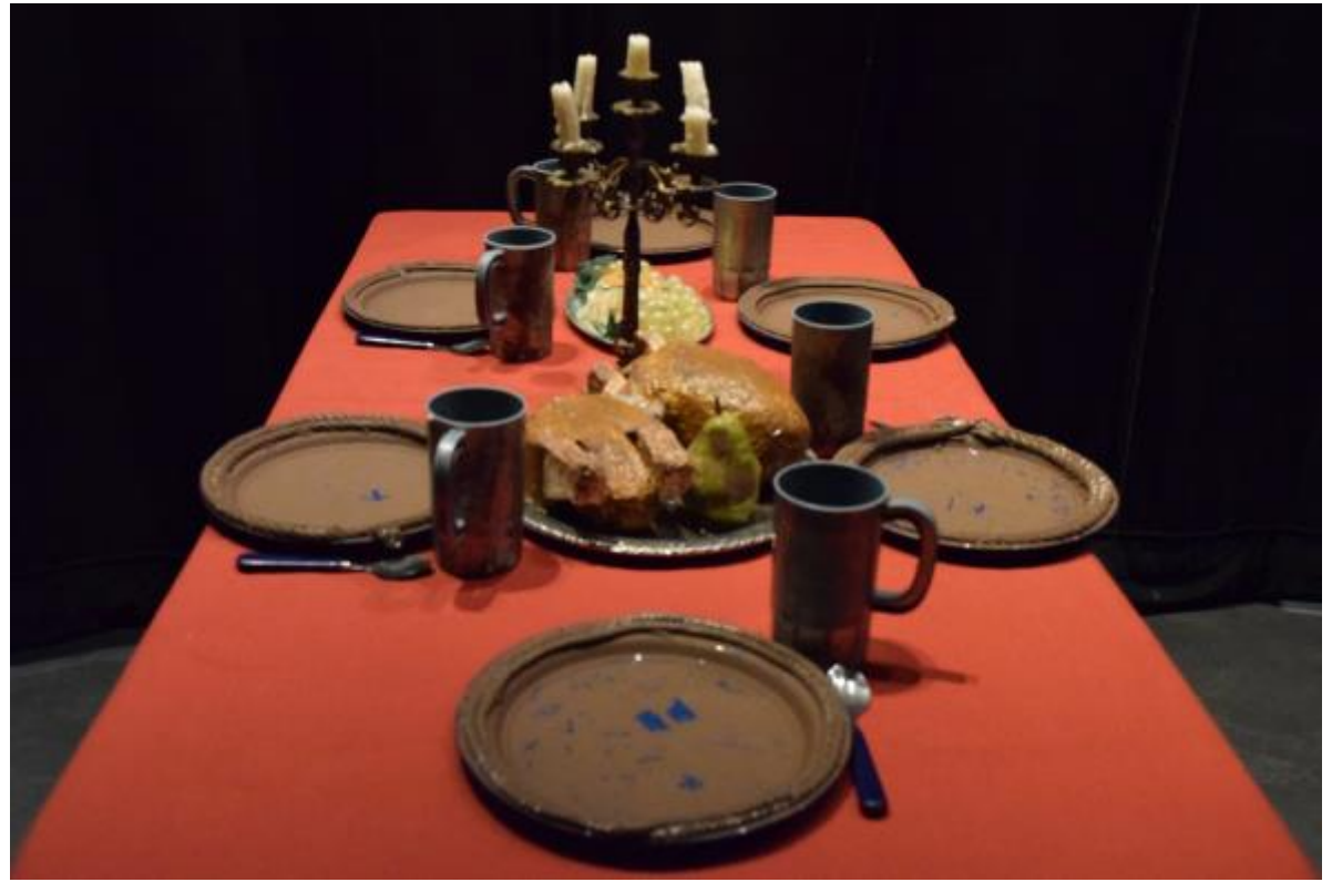
"Small Turkey's and Pear" end

PLEASE SEE PROP CHANGE OVER EVENT INFORMATION SHEET FOR MORE INFORMATION