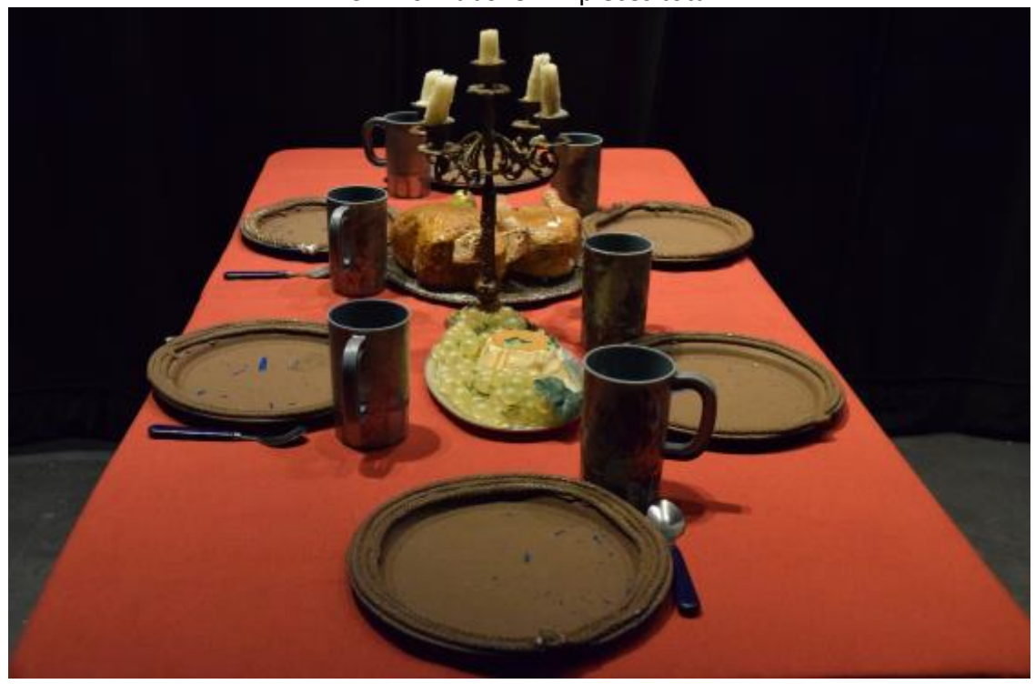
"Flan with Grapes" end