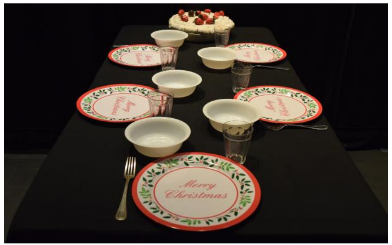
"Head of table" end