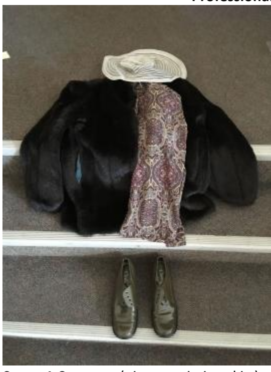
Scene 1 Costume (picture missing skirt) Women's Costume consists of Hat, Blouse, Skirt (not pictured), Fake Fur Coat and Shoes.