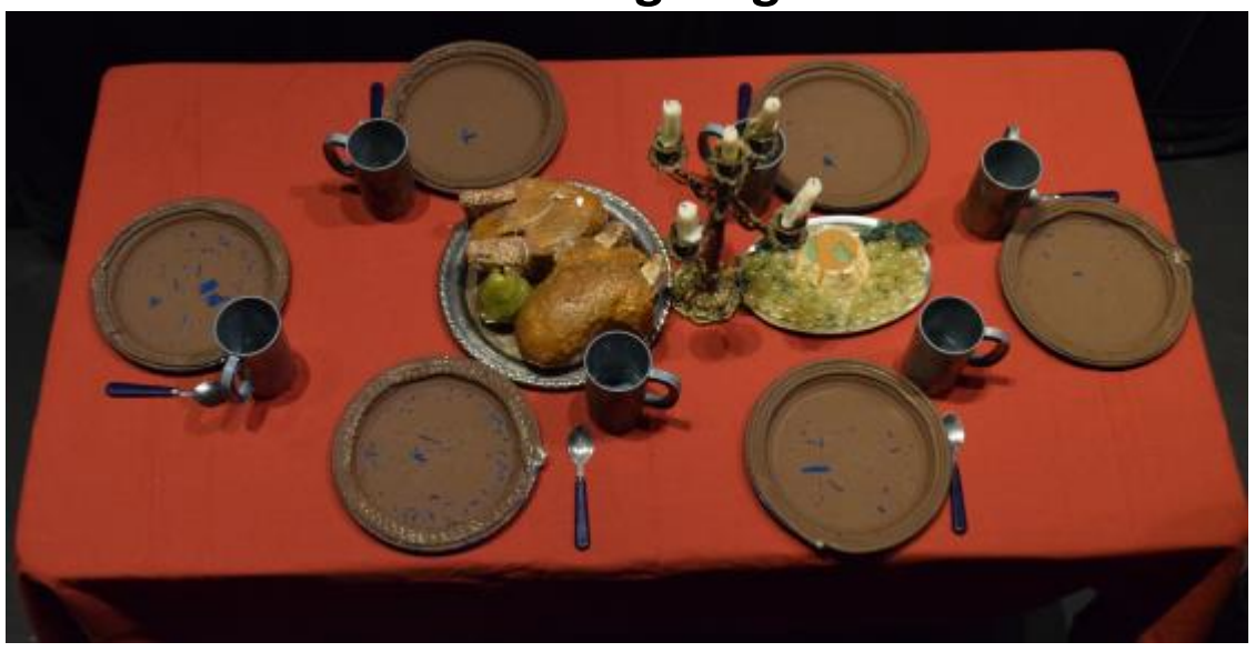
View from above- 21 pieces total