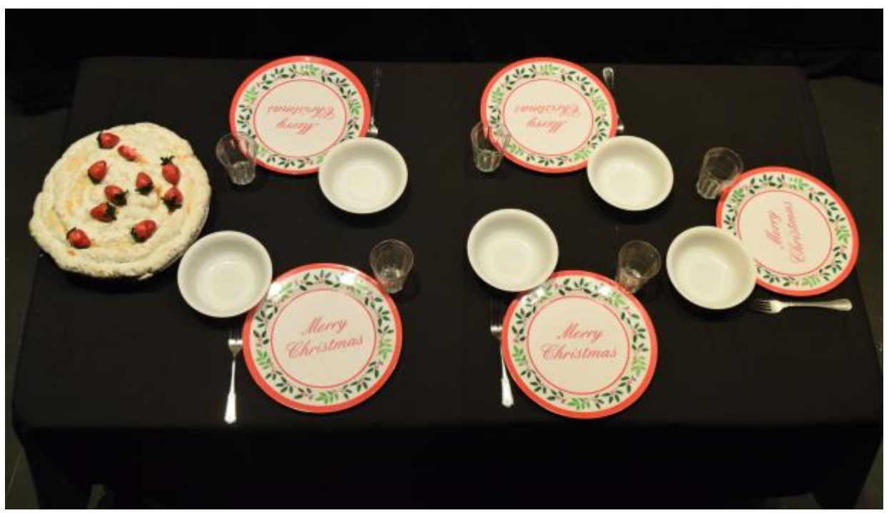
View from above- 21 pieces