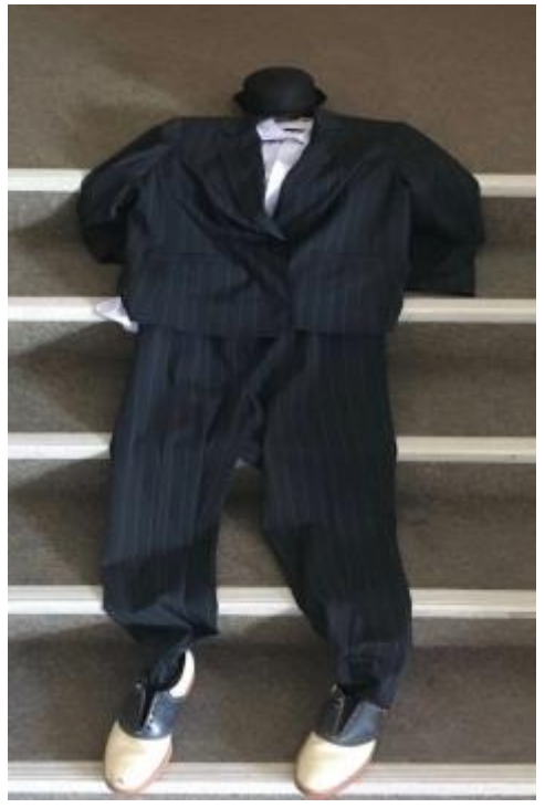
Scene 2 Costume Men's Costume consists of Hat, Shirt, Pants, Coat and Shoes.

PLEASE SEE COSTUME EVENT INFORMATION SHEET FOR MORE INFORMATION