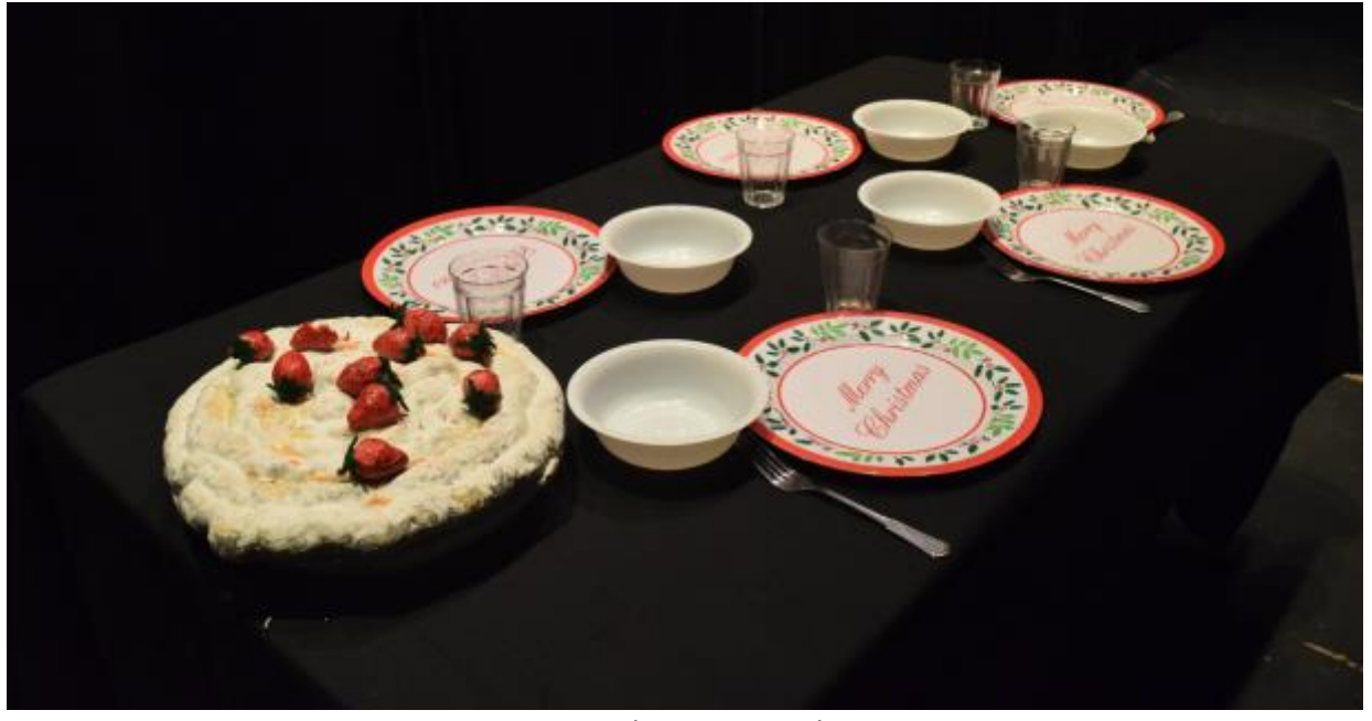
Strawberry Pie end