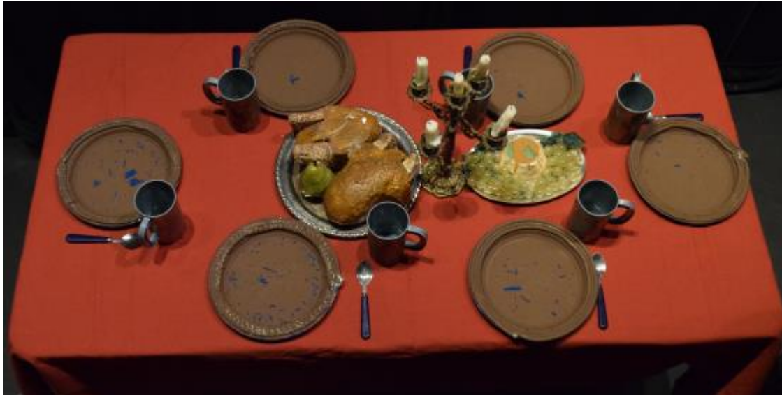
View from above- 21 pieces total