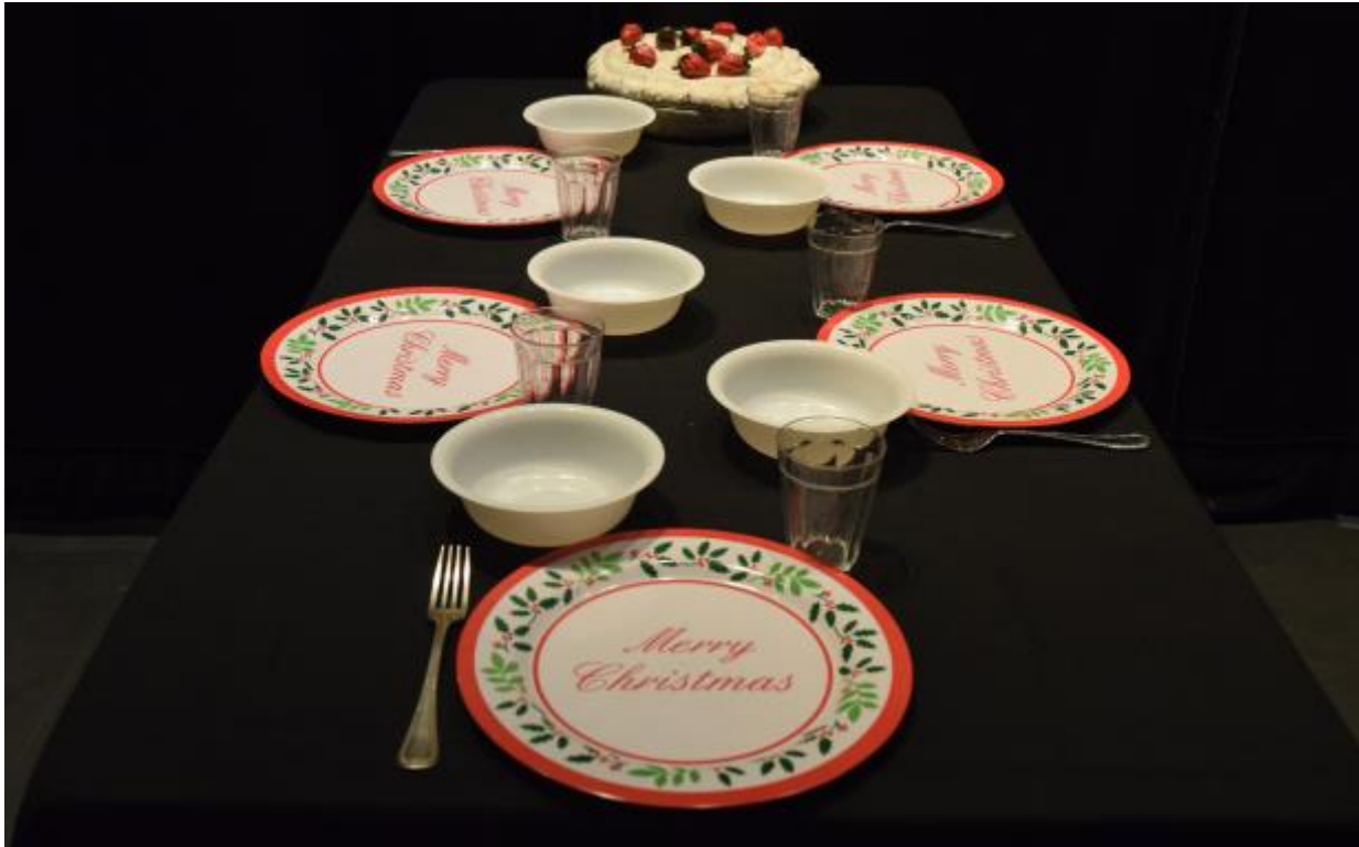
“Head of table” end

PLEASE SEE PROP CHANGE OVER EVENT INFORMATION SHEET FOR MORE INFORMATION