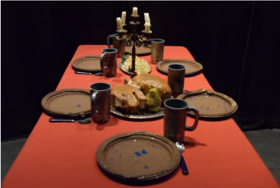
“Small Turkey’s and Pear” end

PLEASE SEE PROP CHANGE OVER EVENT INFORMATION SHEET FOR MORE INFORMATION