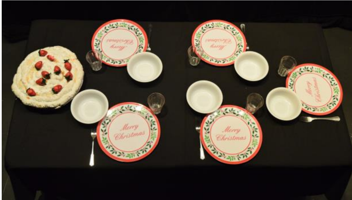
View from above- 21 pieces