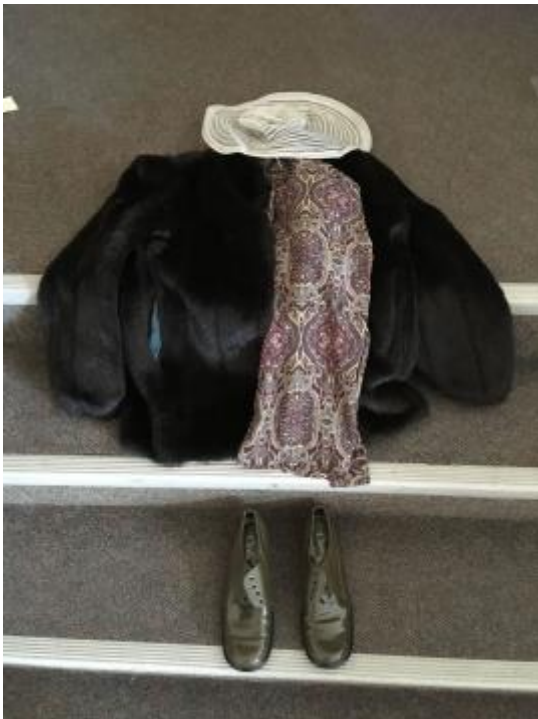
Scene 1 Costume (picture missing skirt) Women’s Costume consists of Hat, Blouse, Skirt (not pictured), Fake Fur Coat and Shoes.

Professional behavior is expected at all times.