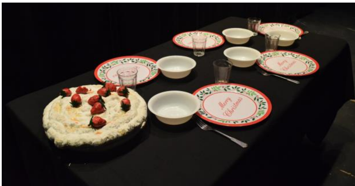
Strawberry Pie end