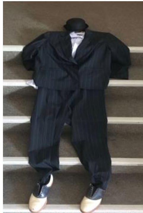
Scene 2 Costume Men’s Costume consists of Hat, Shirt, Pants, Coat and Shoes.

PLEASE SEE COSTUME EVENT INFORMATION SHEET FOR MORE INFORMATION