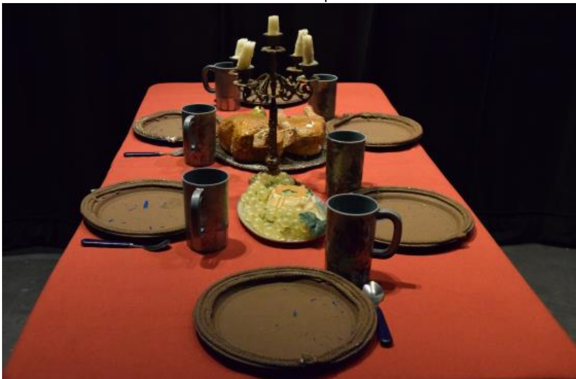
"Flan with Grapes" end