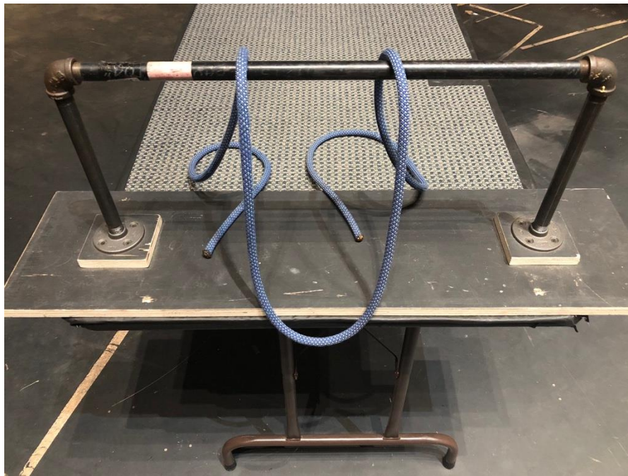
Clove hitch with half hitch

PICTURE VIEW IS FROM THE POSITION WHERE YOU WILL BE COMPETING. The loop may not be EXACTLY as shown, but VERY close: Slight variations may occur.